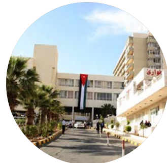
Jordan University Hospital