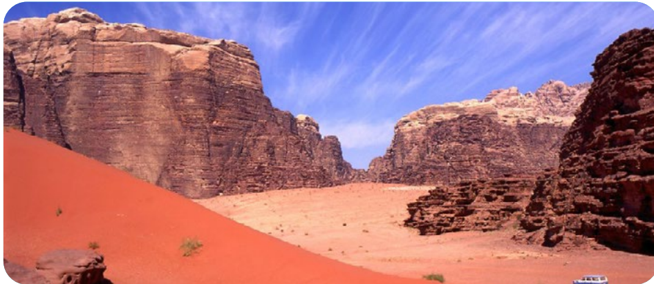
Wadi Rum, Aqaba.